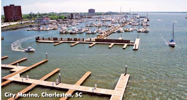
City Marina, Charleston, SC