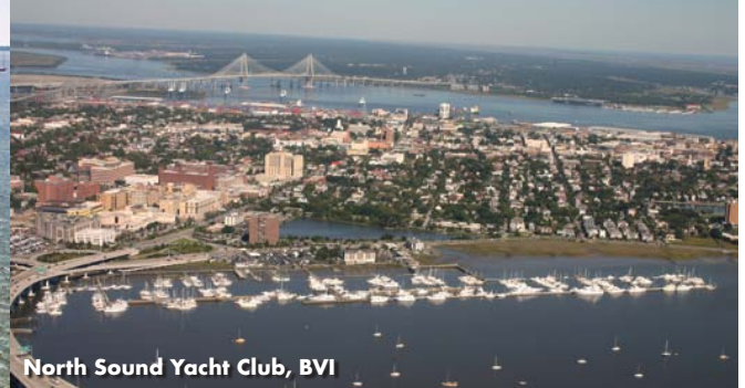
North Sound Yacht Club, BVI

IGY IS NOT JUST A PRETTY FACE. Part of our substantive capabilities comes from Applied Technology & Management – the engineering arm of IGY Marinas. The teams at ATM handle coastal, marine, environmental, and water resources engineering services to private and public clients all over the world and are based in Florida, South Carolina and Dubai.