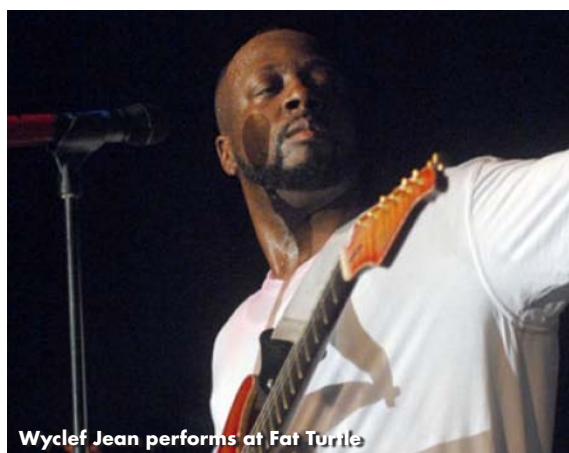
Wyclef Jean performs at Fat Turtle

corn and cotton candy to the Salvation Army.