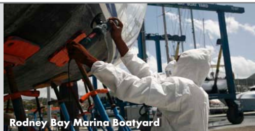
Rodney Bay Marina Boatyard