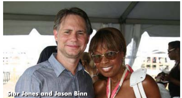
Star Jones and Jason Binn

August and September are loaded with charter fishing groups and marina rendezvous as well as weddings booked for every weekend. The end of July brings the Montauk Village Association's annual fundraiser, the Greenery Scenery Cocktail Party and the annual, four-day Redbone Fishing Tournament is scheduled for September 24, 2010. Former Real Housewife of New York turned New York Times Best-selling author Bethenny Frankel, will be returning to her home away from home - the Montauk Yacht Club - to host another Skinnygirl Margarita party at the Barracuda Bar, July 31. Details and photos to come next issue! For more information, please visit www.montaukyachtclub.com .