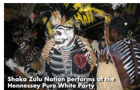
Shaka Zulu Nation performs at the Hennessey Pure White Party

Yacht Haven Grande | P: +1 340 774 9500 | www.yachthavengrande.com