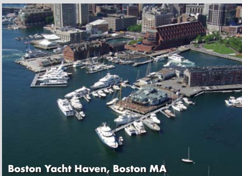
Boston Yacht Haven, Boston MA

P: 617-367-5050 | www.thebostonyachthaven.com | VHF channel 9/16