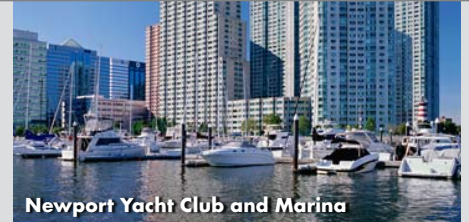
Newport Yacht Club and Marina

Montauk Yacht Club Resort & Marina T: 631-668-3100 info@montaukyachtclub.com