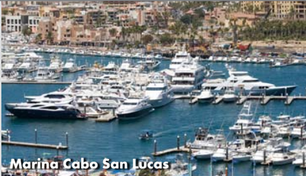
Marina Cabo San Lucas