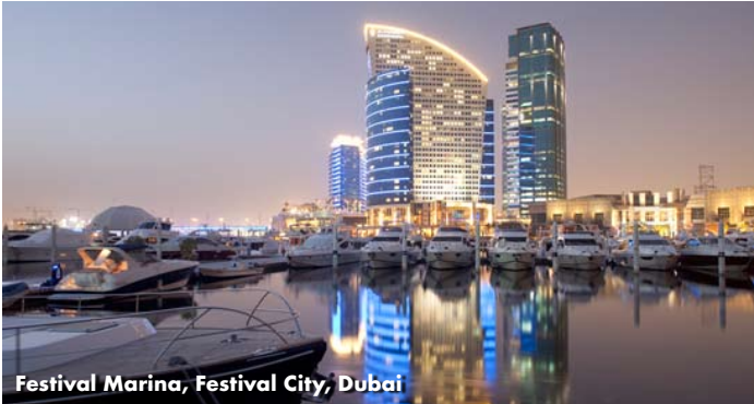
Festival Marina, Festival City, Dubai

MOURJAN MARINAS IGY has been all over the marine newswire this year. And rightly so, as they've been in growth mode since the get-go. With new projects in Sochi, Russia for the Olympics and a waterfront feat in the making on the coast of Morocco has Mourjan leading a new way for Middle East luxury yachting destinations.