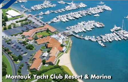
Montauk Yacht Club Resort & Marina

Marina Cabo San Lucas normaf@cabomarina.com.mx www.igy-cabosanlucas.com