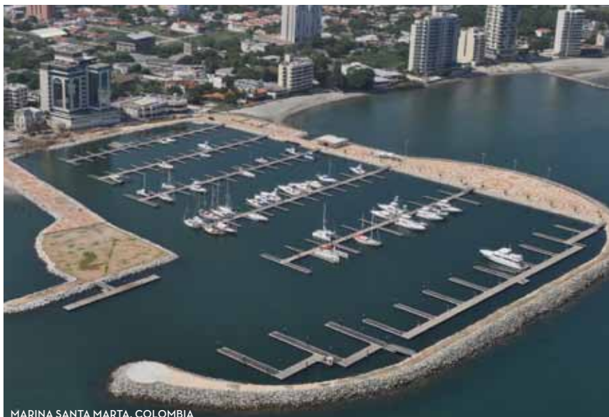
MARINA SANTA MARTA, COLOMBIA

THE YACHT CLUB AT ISLE DE SOL, ST. MAARTEN