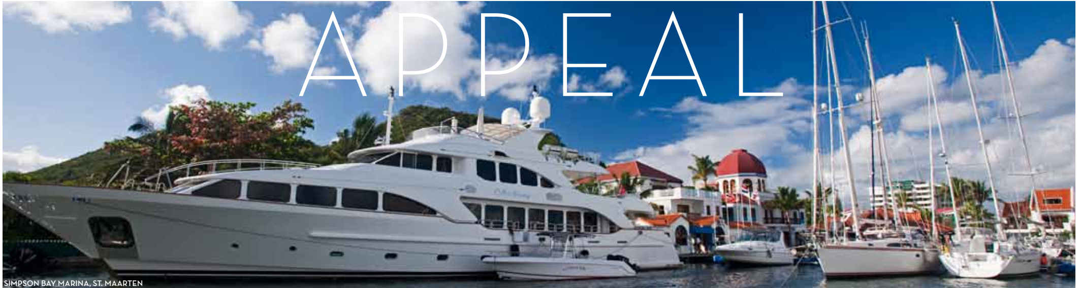
SIMPSON BAY MARINA, ST. MAARTEN

FOUNDED IN 2005, IGY MANAGES 12 MARINAS AND OWNS 7.