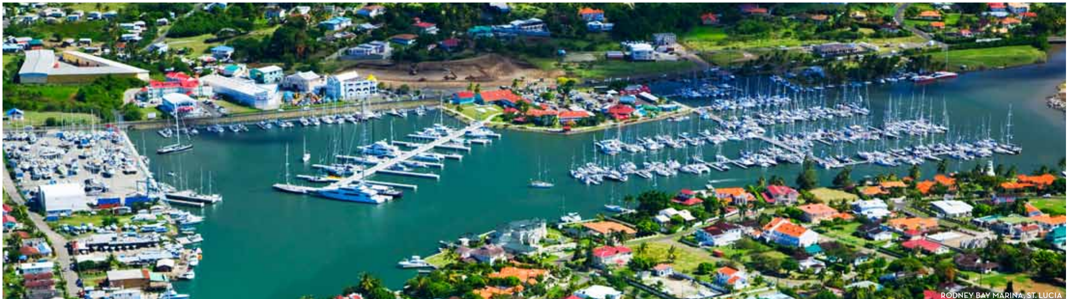
RODNEY BAY MARINA, ST. LUCIA