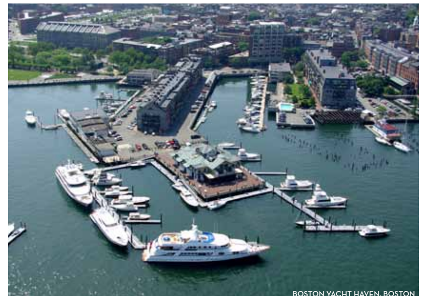
BOSTON YACHT HAVEN, BOSTON