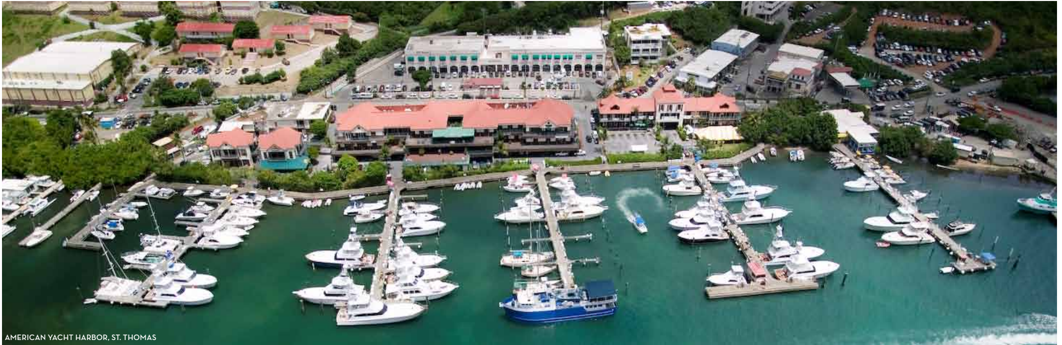
AMERICAN YACHT HARBOR, ST. THOMAS